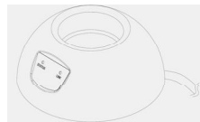
GS2000U Base Station Unit (USB)